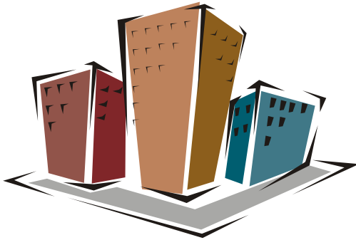
Andrew M. Cuomo

A handwritten signature in blue ink that reads "Andrew M. Cuomo".